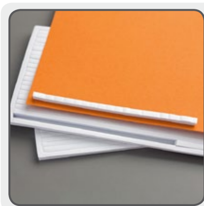
Foam Adhesive Strips