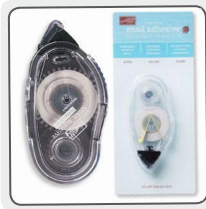
SNAIL Adhesive #104332