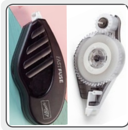
Fast Fuse Adhesive #129026