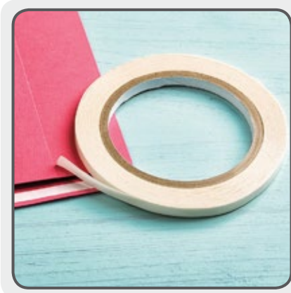
Tear & Tape